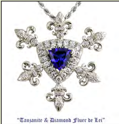
Donated by Appleby's Animals

SCI's Annual Hunters' Convention, attended by over 20,000 SCI and Education Sables members, is the primary fundraiser for SCIF Education Programs and it all started at the Education Sables Booth with the Benefit Award Sweepstakes. This year's Benefit Award Sweepstakes, supported by generous donations from long-time exhibitors and donors: Appleby's Animals, Bud Burger Bronzes and Sheepskin Coat Factory raised close to $15,000 for SCIF Education Programs. Three prize offerings enabled ticket holders the option to choose which item to pursue for a chance of winning. Sweepstakes tickets went on sale Wednesday, the show's grand opening day, continued through Friday, and the lucky winners were drawn at the luncheon.