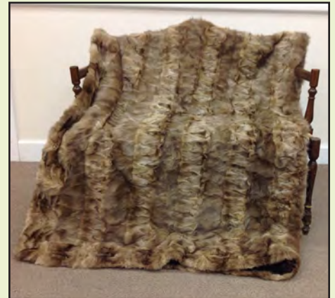
Donated by Sheepskin Coat Factory